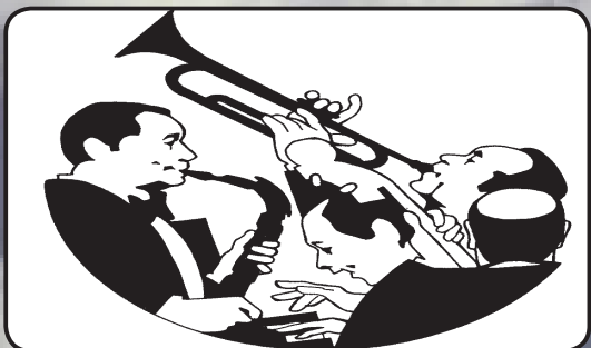
JAZZ ON THE TERRACE: JAZZ PLAYERS ANONYMOUS