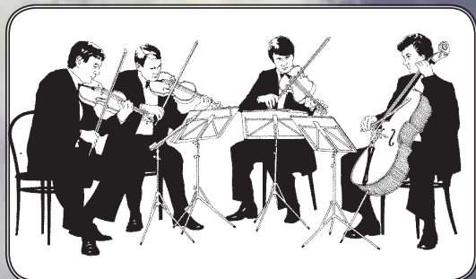
KIDSCCLASSICS: ALL IN THE MUSICAL FAMILY- STRINGS