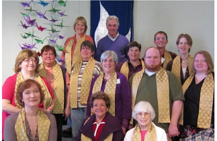
Getting ready for the act: 'MUF Choir and Cranes'